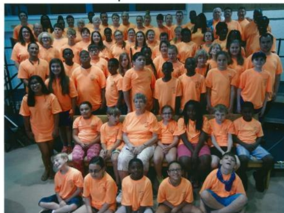
Camp Leo ~ 2017

At a special dinner, St. Andrew was honored by the Camp Leo Campers who presented a 3-page greeting card signed by all campers, thanking the church for the wonderful hospitality as their home away from home.