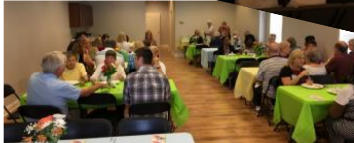
Lunch in our new Bluffton space.